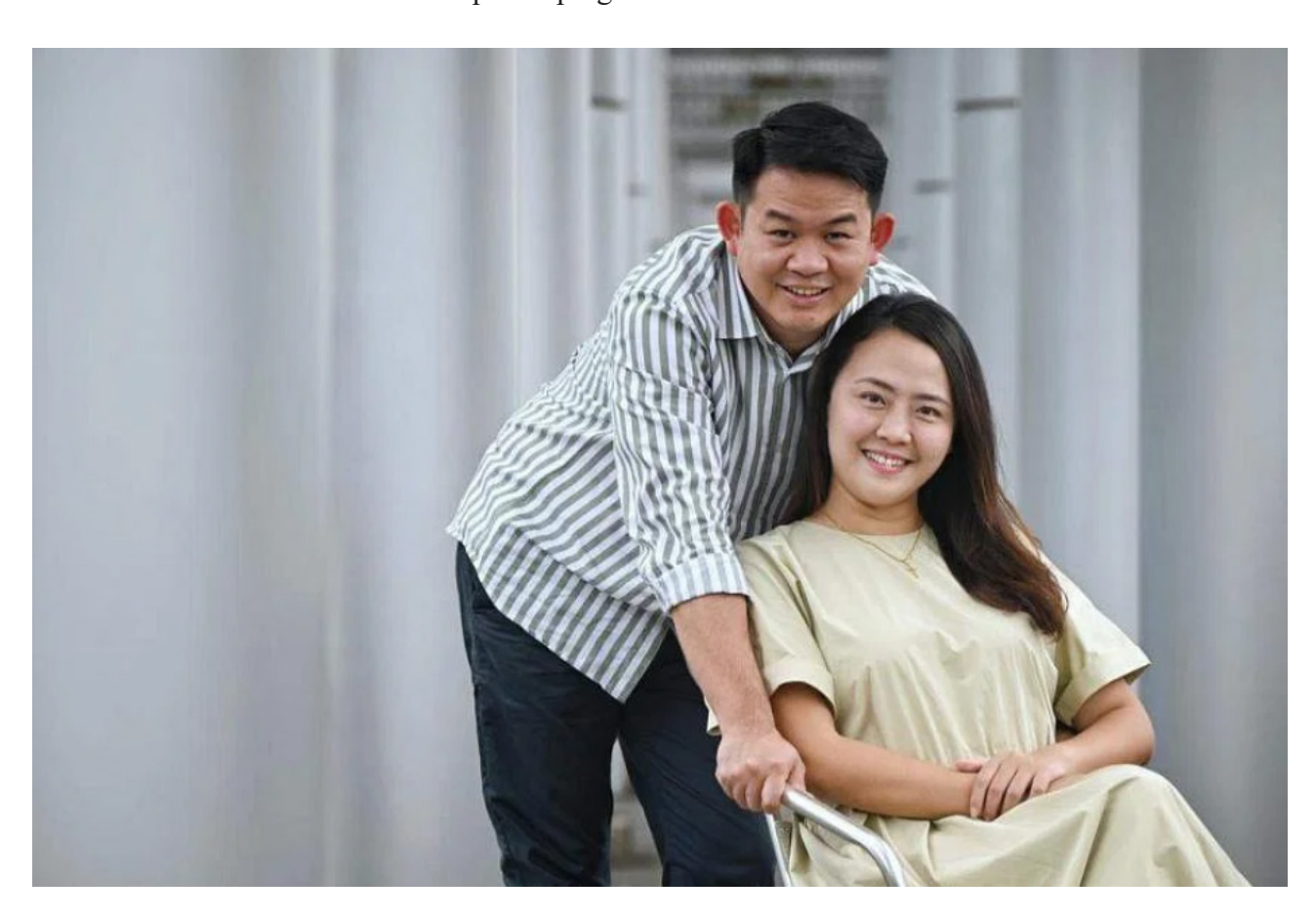
'Wherever there is darkness, we want to make a difference': Couple helping Ukraine war survivors

"It's a sense of empathy for people who live in a normal, peaceful state like Singapore, who are then plunged into a war. I wanted to be there physically to let them know that there are people on the other side of the world who care."